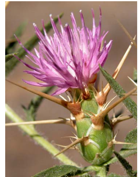
Purple Star Thistle Centaurea calcitrapa Introduced Annual-Biennial Sunflower Family