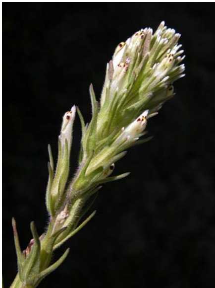
Valley Tassels Castilleja attenuata Native Annual Snapdragon Family