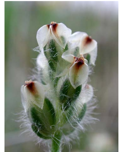
California Dwarf Plantain Plantago erecta Native Annual Plantain Family