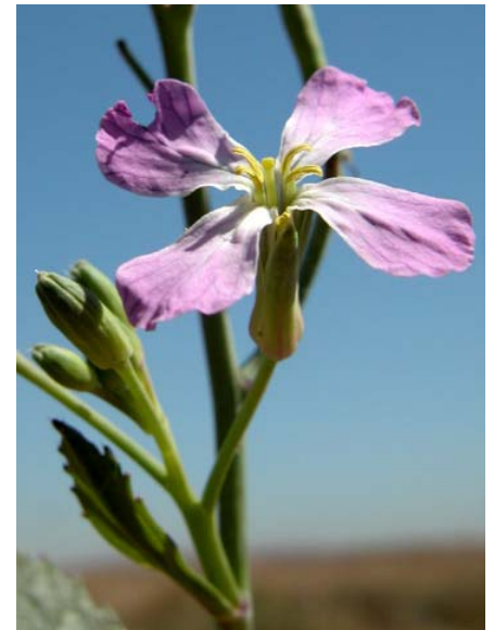
Wild Radish Raphanus sativus Introduced Annual Mustard Family