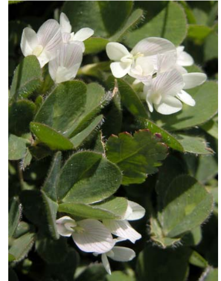
Subterranean Clover Trifolium subterraneum Introduced Annual Pea Family