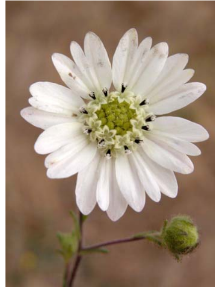
Hayfield Tarweed Hemizonia congesta ssp. luzulaefolia Native Perennial Sunflower Family