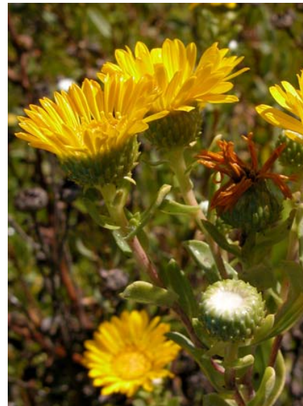
Narrowleaf Pacific Gumplant Grindelia stricta var. angustifolia Native Perennial Sunflower Family