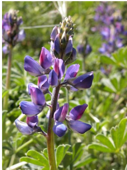
Arroyo Lupine Lupinus succulentus Native Annual Pea Family