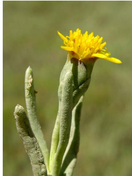
Fleshy Jaumea Jaumea carnosa Native Perennial Sunflower Family