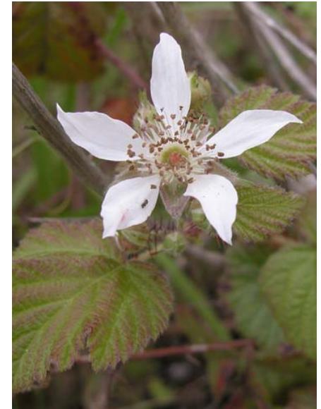
Native California Blackberry Rubus ursinus Native Perennial Rose Family