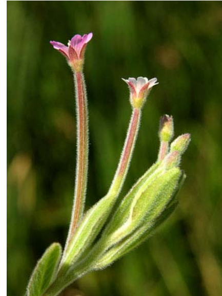
Common Willowherb Epilobium ciliatum ssp. ciliatum Native Perennial Evening Primrose Family