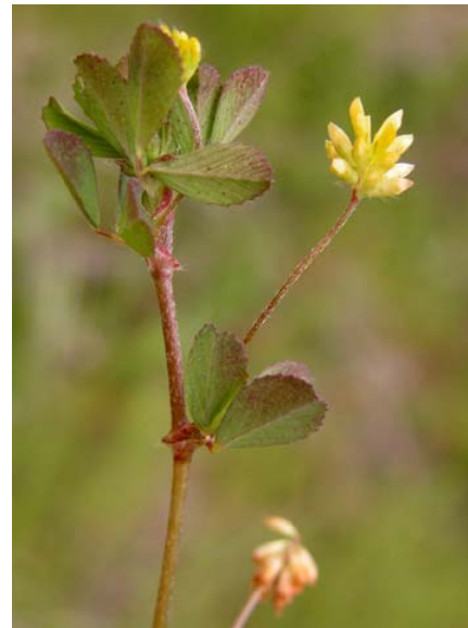
Shamrock Clover Trifolium dubium Introduced Annual Pea Family