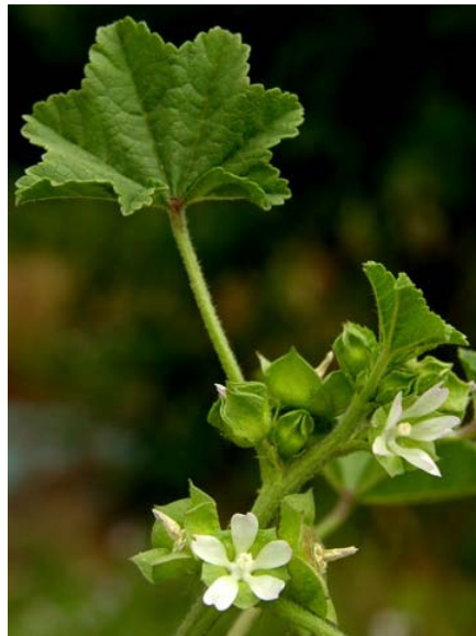
Hidden-flower Cheeseweed Malva parviflora Introduced Annual Mallow Family