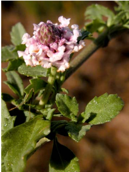
Lemon Verbena Phyla nodiflora var. nodiflora Native Perennial Vervain Family