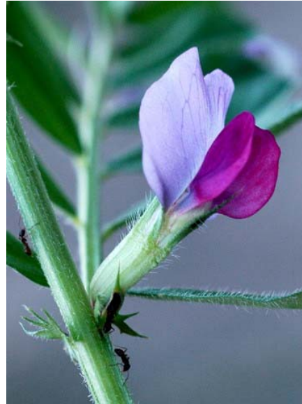
Spring Vetch Vicia sativa ssp. sativa Introduced Annual Pea Family