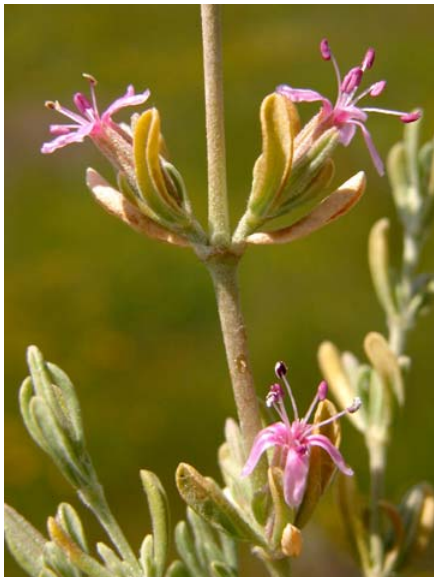
Alkali Heath Frankenia salina Native Perennial Frankenia Family