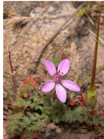
Red-stem Filaree Erodium cicutarium Introduced Annual Geranium Family