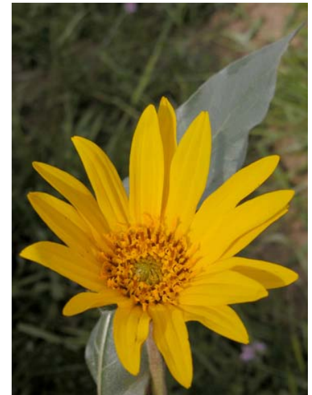
Narrow-leaf Mule's Ear Wyethia angustifolia Native Perennial Sunflower Family