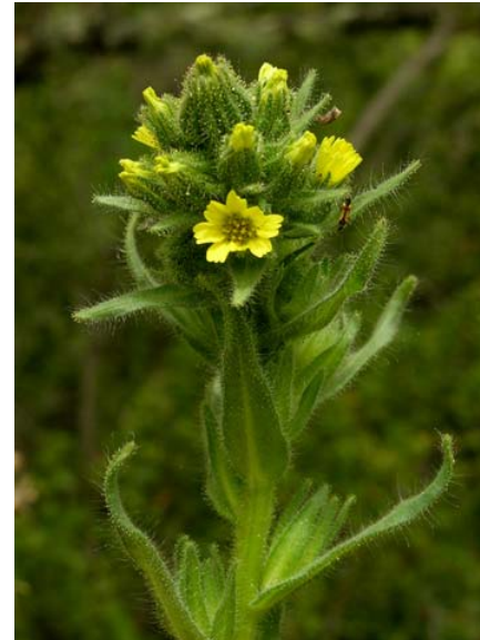
Common / Coast Tarweed Madia sativa Native Annual Sunflower Family