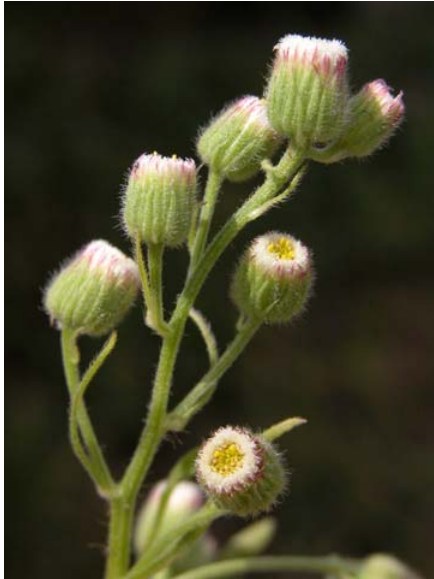
South American Horseweed Conyza bonariensis Introduced Annual Sunflower Family