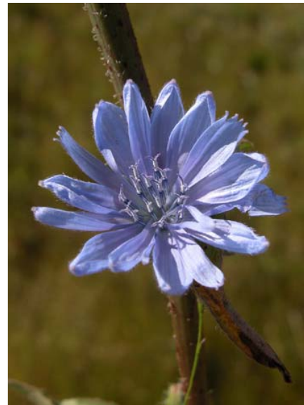
Chicory Cichorium intybus Introduced Perennial Sunflower Family