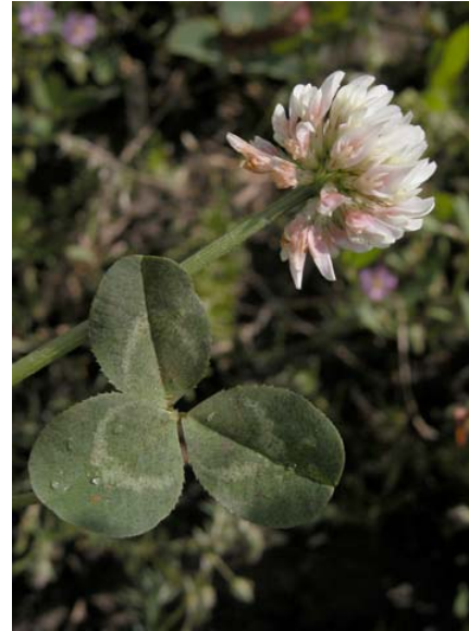
White Clover Trifolium repens Introduced Perennial Pea Family