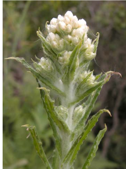
California Everlasting Gnaphalium californicum Native Biennial Sunflower Family