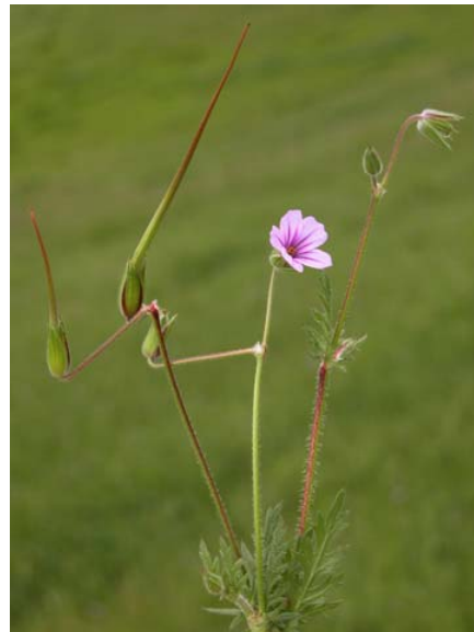
Long-beaked Filaree Erodium botrys Introduced Annual Geranium Family