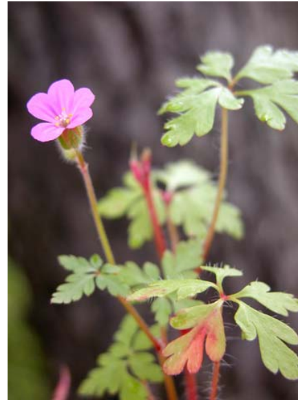
Herb Robert Geranium robertianum Introduced Annual-Biennial Geranium Family