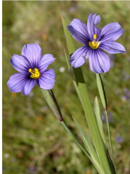
Blue-eyed Grass Sisyrinchium bellum Native Perennial Iris Family