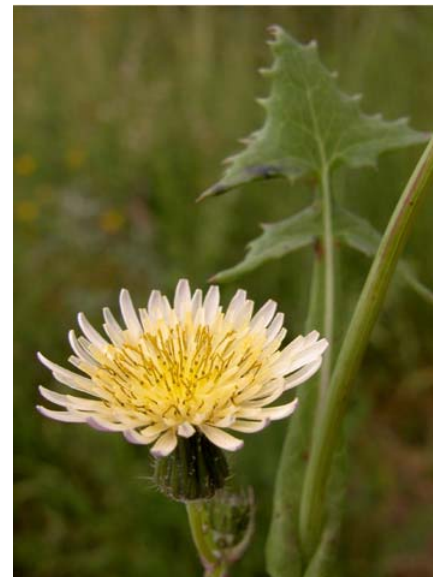
Common Sow Thistle Sonchus oleraceus Introduced Annual Sunflower Family