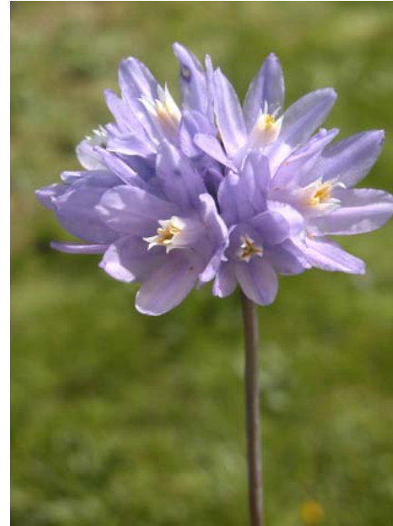
Blue Dicks Dichelostemma capitatum ssp. capitatum Native Perennial Lily Family