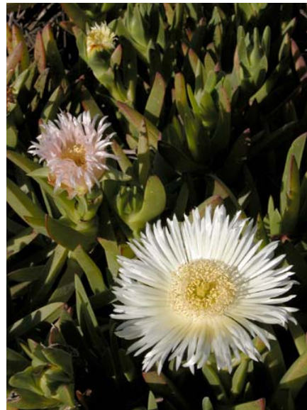
Yellow Hottentot Fig Carpobrotus edulis Introduced Perennial Fig-Marigold Family