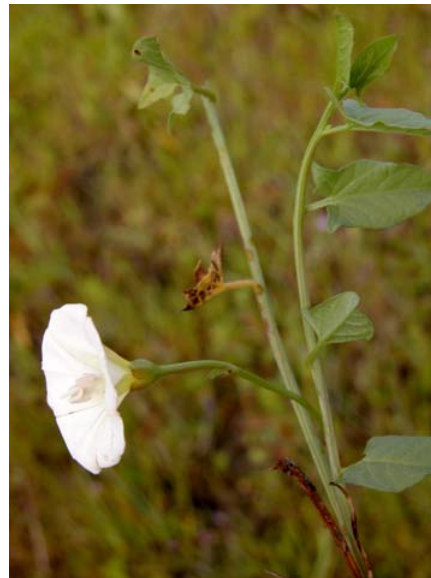
Field Bindweed Convolvulus arvensis Introduced Perennial Morning-Glory Family