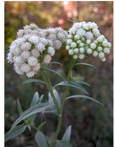
Douglas/Salt Marsh Baccharis Baccharis douglasii Native Perennial Sunflower Family