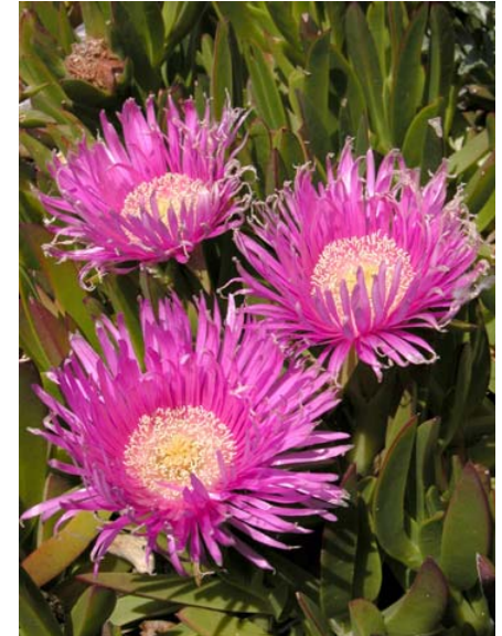
Sea Fig Carpobrotus chilensis Introduced Perennial Fig-Marigold Family