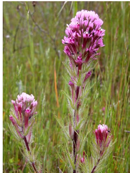
Purple Owl's Clover Castilleja exserta ssp. exserta Native Annual Snapdragon Family