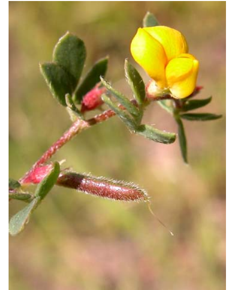
California Lotus Lotus wrangelianus Native Annual Pea Family