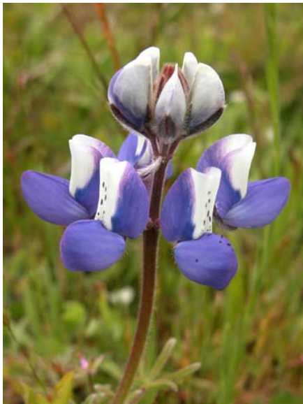
Douglas Sky Lupine Lupinus nanus Native Annual Pea Family