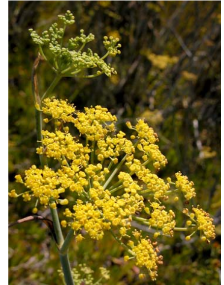
Sweet Fennel Foeniculum vulgare Introduced Perennial Carrot Family