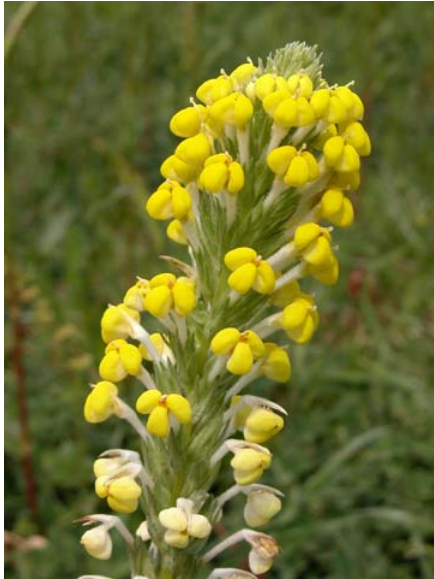
Yellow Johnny-tuck Triphysaria eriantha ssp. eriantha Native Annual Snapdragon Family