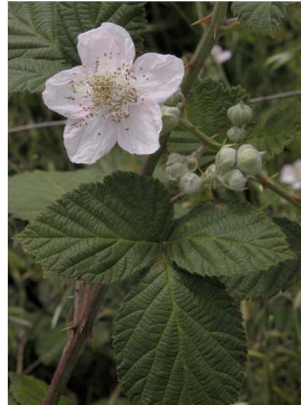
Himalayan Blackberry Rubus discolor Introduced Perennial Rose Family