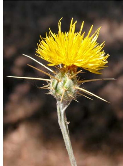
Yellow Star Thistle Centaurea solstitialis Introduced Annual Sunflower Family