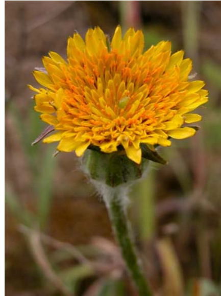
Large-flower Native Dandelion Agoseris grandiflora Native Perennial Sunflower Family