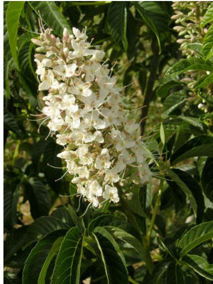
California Buckeye Aesculus californica Native Perennial Buckeye Family