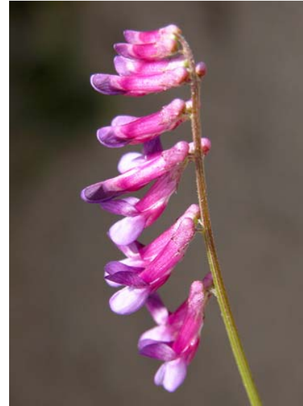
Winter Vetch Vicia villosa ssp. varia Introduced Annual-Biennial Pea Family