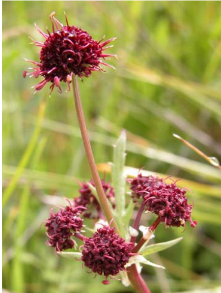
Purple Sanicle Sanicula bipinnatifida Native Perennial Carrot Family