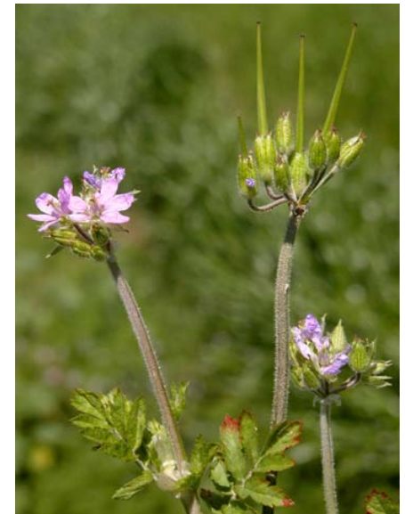
White-stem Filaree Erodium moschatum Introduced Annual Geranium Family