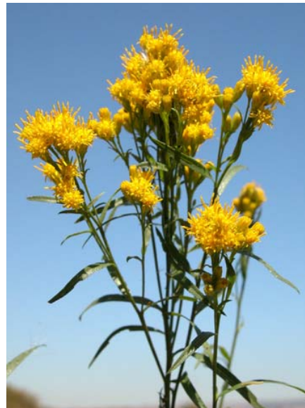
Western Goldenrod Euthamia occidentalis Native Perennial Sunflower Family