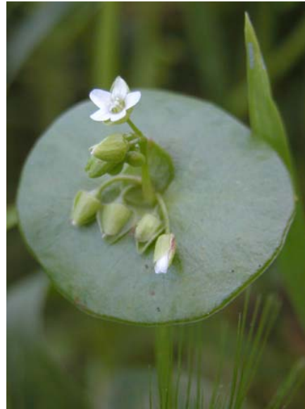
Common Miner's Lettuce Claytonia perfoliata ssp. perfoliata Native Annual Purslane Family