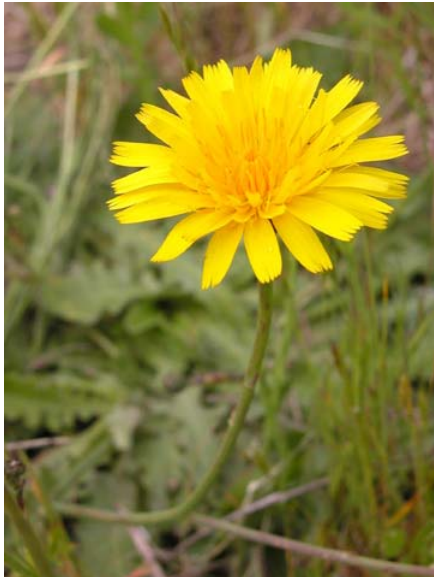
Rough Cat's-ear Hypochaeris radicata Introduced Perennial Sunflower Family