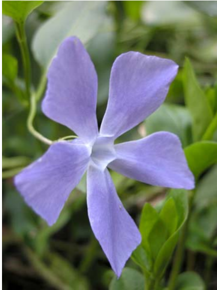
Greater Periwinkle Vinca major Introduced Perennial Dogbane Family