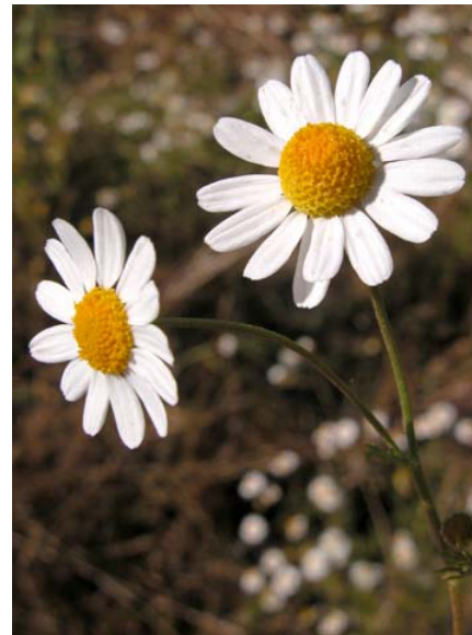
Mayweed Anthemis cotula Introduced Annual Sunflower Family