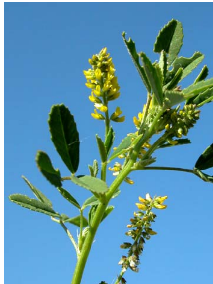
Sour Clover Melilotus indica Introduced Annual-Biennial Pea Family