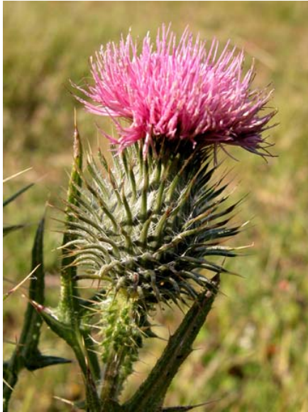
Bull Thistle Cirsium vulgare Introduced Biennial Sunflower Family