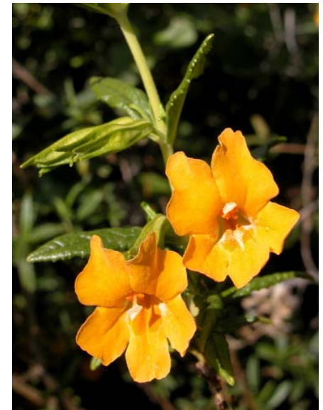
Bush Monkey Flower Mimulus aurantiacus Native Perennial Snapdragon Family