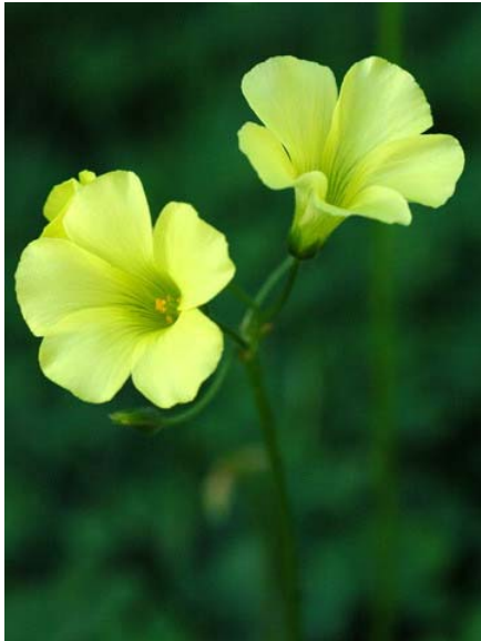
Bermuda Buttercup Oxalis pes-caprae Introduced Perennial Oxalis Family