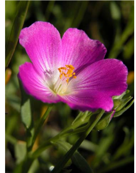
Magenta Red Maids Calandrinia ciliata Native Annual Purslane Family