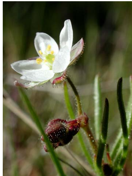
Stickwort Spargula arvensis ssp. arvensis Introduced Annual Pink Family