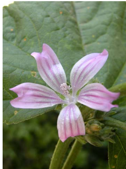
Bull Mallow Malva nicaeensis Introduced Annual Mallow Family