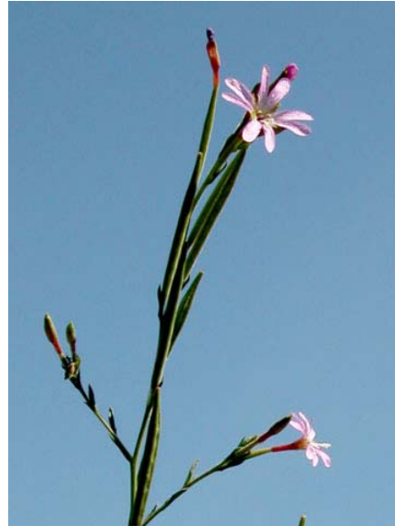
Panicked / Weedy Willowherb Epilobium brachycarpum Native Annual Evening Primrose Family