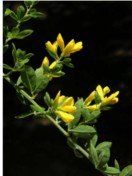
French Broom Genista monspessulana Introduced Perennial Pea Family