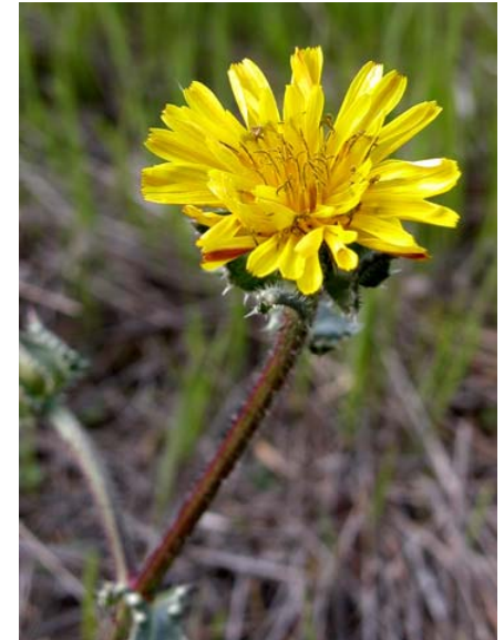
Bristly Ox-tongue Picris echioides Introduced Annual-Biennial Sunflower Family