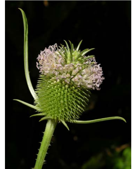
Wild Teasel Dipsacus sativus Introduced Biennial Teasel Family