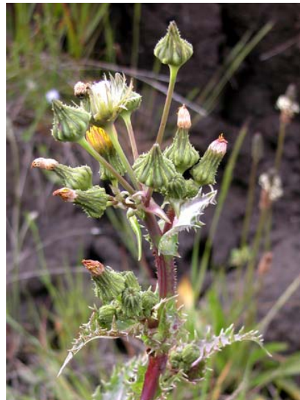
Prickly Sow Thistle Sonchus asper ssp. asper Introduced Annual Sunflower Family