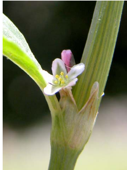
Common Yard Knotweed Polygonum arenastrum Introduced Annual Buckwheat Family