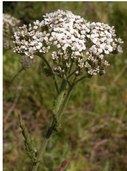
Yarrow Achillea millefolium Native Perennial Sunflower Family