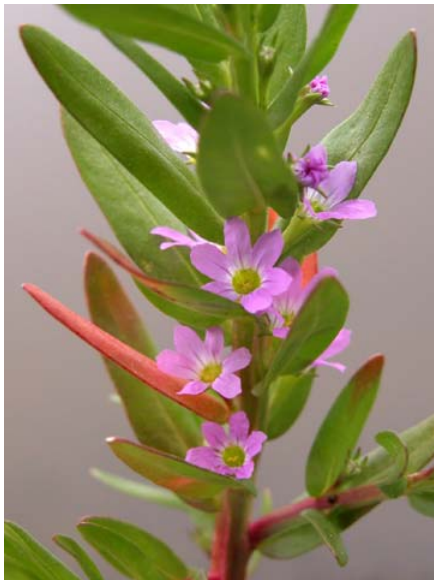
Grass Poly Loosetrife Lythrum hyssopifolium Introduced Annual-Perennial Loosetrife Family