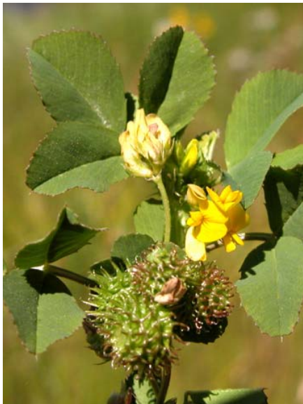
California Bur Clover Medicago polymorpha Introduced Annual Pea Family