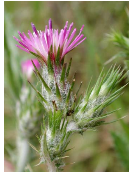
Italian Thistle Carduus pycnocephalus Introduced Annual Sunflower Family