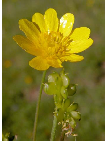
California Buttercup Ranunculus californicus Native Perennial Buttercup Family