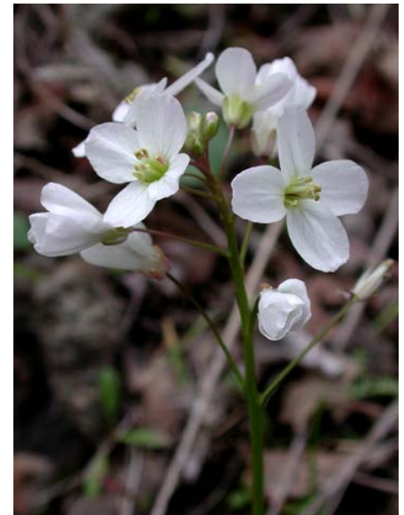
Milkmaids Cardamine californica Native Perennial Mustard Family