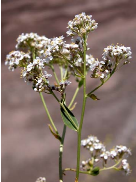
Slender Peren. Peppergrass Lepidium latifolium Introduced Perennial Mustard Family