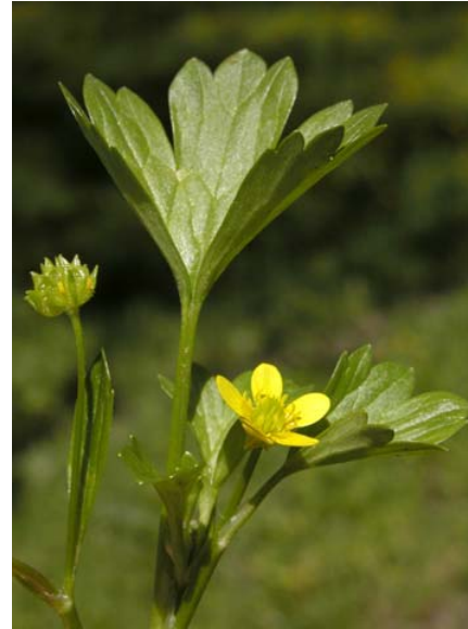
Prickleseed Buttercup Ranunculus muricatus Introduced Annual Buttercup Family