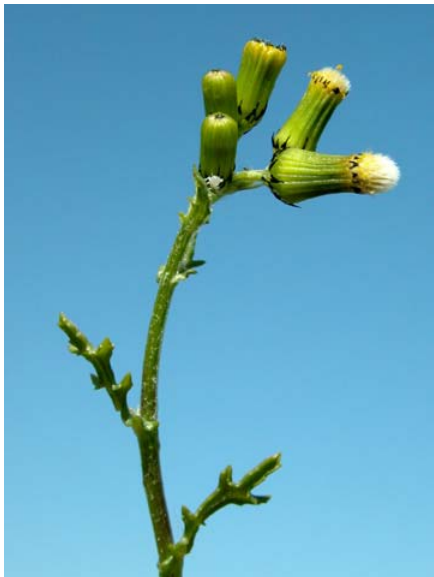
Common Groundsel Senecio vulgaris Introduced Annual Sunflower Family