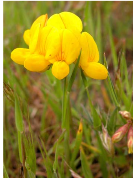
Bird's-foot Deerweed Lotus corniculatus Introduced Perennial Pea Family