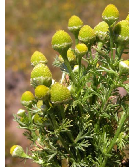
Pineapple Weed Chamomilla suaveolens Introduced Annual Sunflower Family